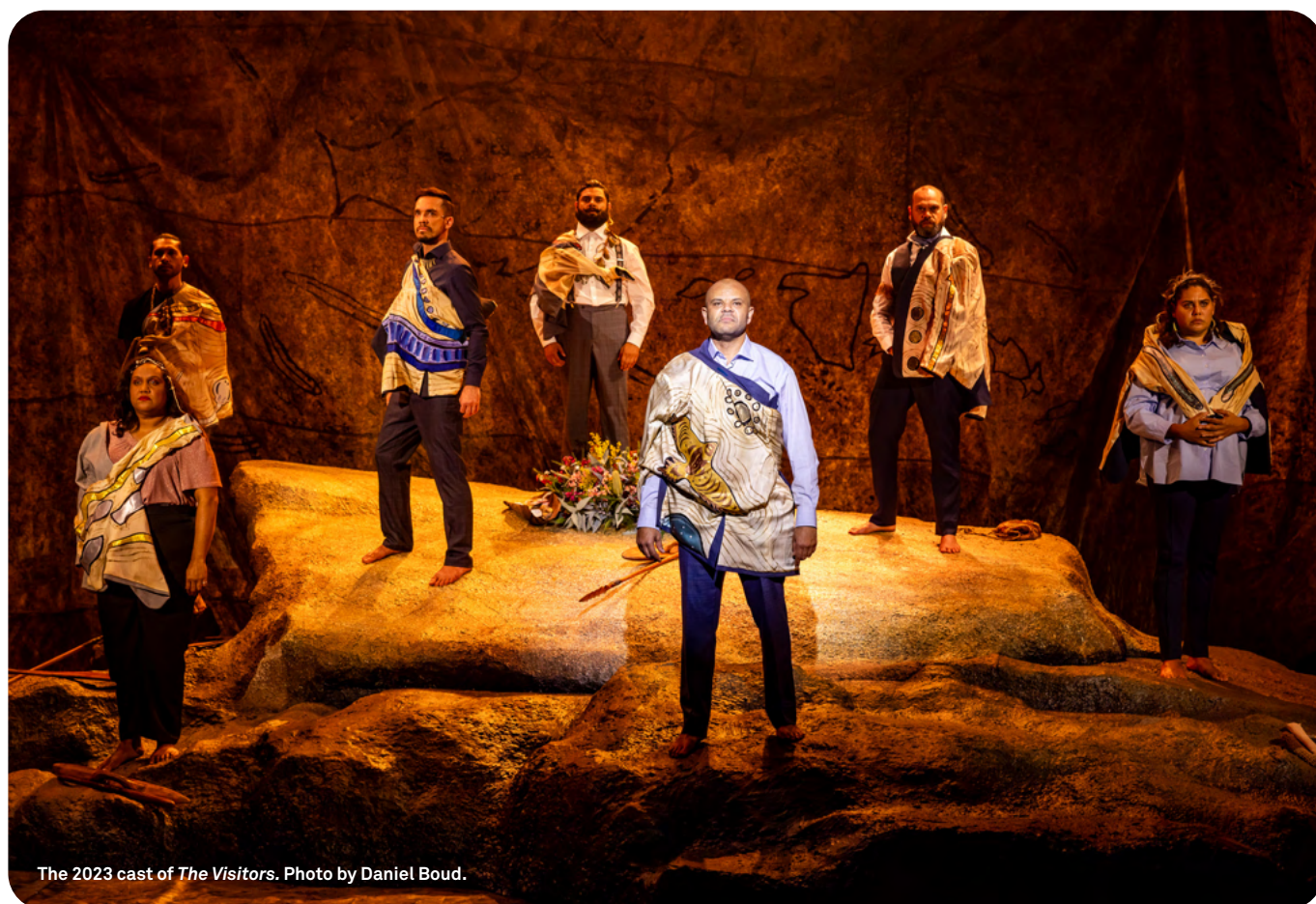
The 2023 cast of The Visitors.

Moogahlin Performing Arts acknowledges the Gadigal and Ngemba Peoples who are the traditional custodians of the land and waters on which the Company gathers. We pay our respects to Elders past and present, and we extend that respect to all First Peoples with whom we work and with whom we share stories.